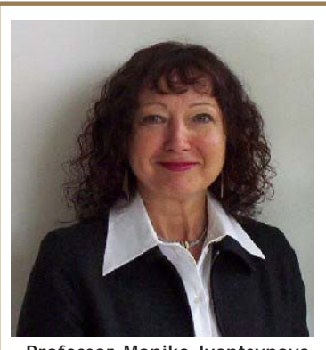
Professor Monika Ivantsynova

Fluid-power technology encompasses most applications that use liquids or gases to transmit power in the form of pressurized fluid and is a 33 billion dollar industry worldwide. Monika lvantsynova, ABE and MAHA Professor of Fluid Power Systems, stated that they are working to create the next generation of pumps and motors, which are the heart of each fluid power system. Monika predicts we can reduce the energy consumption of fluid power systems up to 30% by using a new generation of pumps, motors and new throttleless actuators, which would be an annual savings of 100 million barrels of oil in the transportation sector alone. Monika also stated that each 10% improvement in the efficiency of current uses of fluid power would save about 7 billion dollars a year in U.S. energy costs.